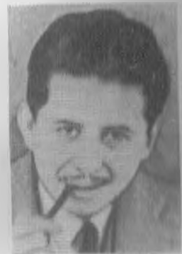
Frank Belknap Long, Jr.