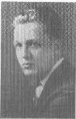
Stanley G. Weinbaum