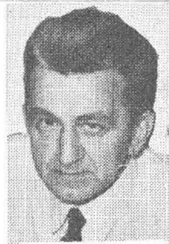
Frank R. Paul